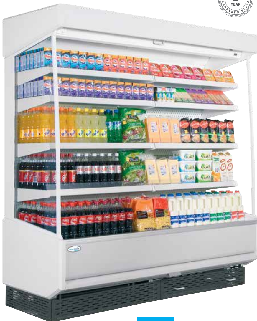
RC II 190